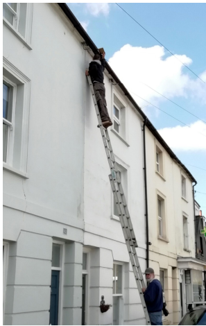
Dave and Nick installing one of the nest boxes.

It is with great pleasure that we can report that ten new Swift nest boxes have been installed at homes in Western Road!