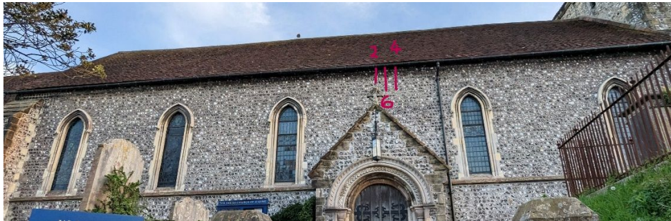
St. Anne's Church – West