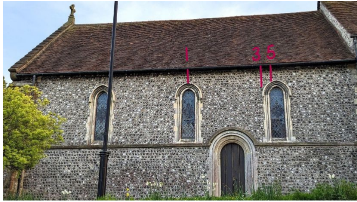
St. Anne's Church – East