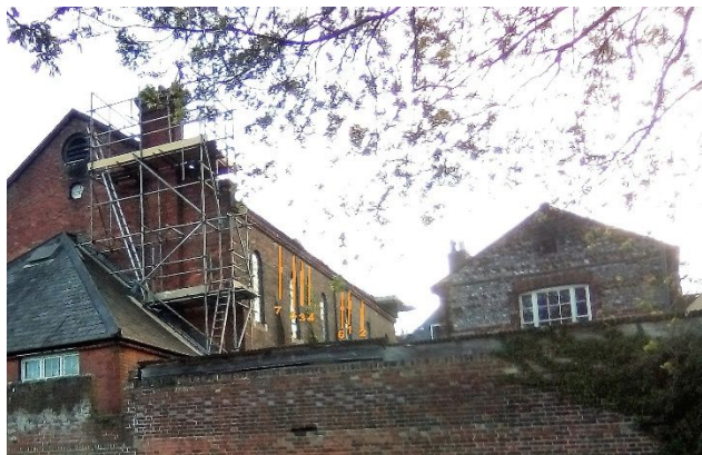
The rear of the Flea Market