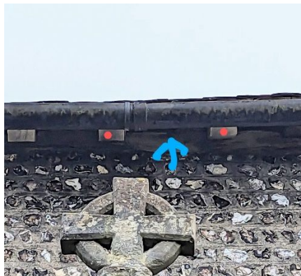
A close -up of nest 2 at the church to show you the space where the Swifts enter.