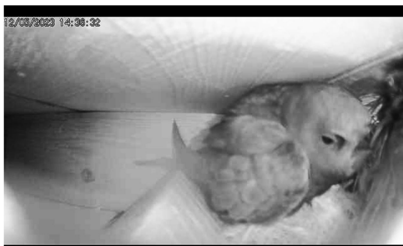
One of the Swifts incubating the eggs

This is where Swift Watchers are so valuable – you might be able to see the rear of a building or walk past a colony at a different time of day to our surveyors and report it to us. Six of the active nests recorded this year were first spotted by Swift Watchers!