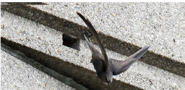
Photograph of Swift leaving the nest, from World Swift Day

A poster is attached to this newsletter – and we hope that as many people as possible will print it out and display it in their window to spread the word to friends, neighbours, and colleagues.