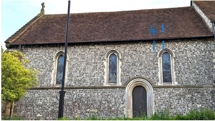
St. Anne's Church – East