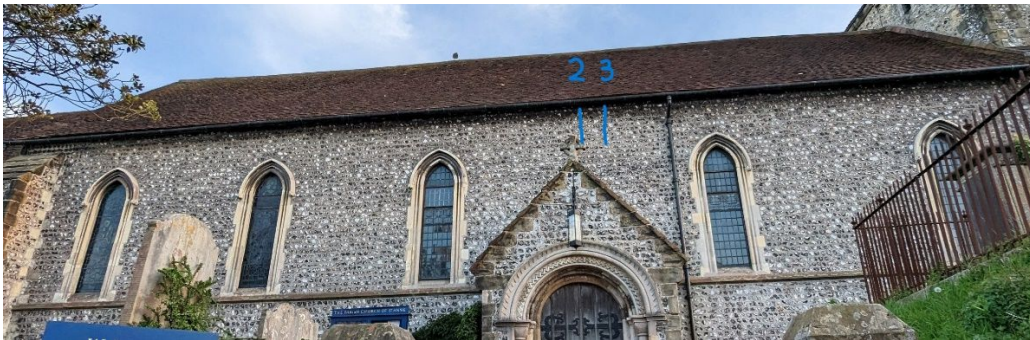
St. Anne's Church – West