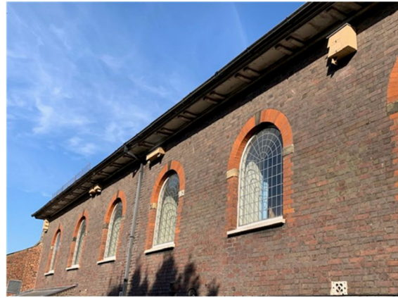
All Saints Centre nest boxes

We are very pleased to have received lots of requests from Lewes Residents asking for advice about installing Swift boxes on their home or workplace! As you know, the lack of suitable nest spaces is one of the factors that has contributed to the decline in the Swift population: as many old buildings have been renovated or demolished and modern building methods do not allow for the nooks and crannies where Swifts choose to nest.