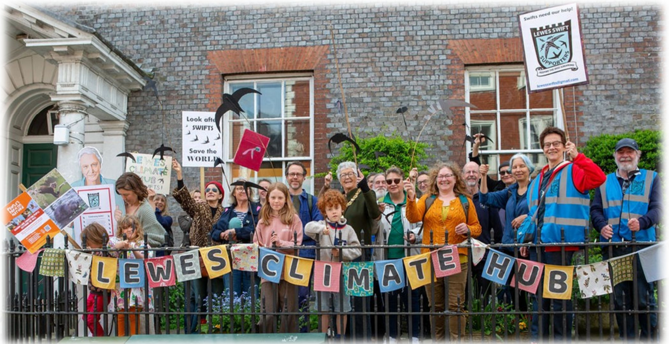
At the end of our Swift parade to welcome back the Swifts in April