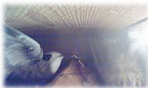
Flapping wings, 26 th July