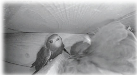
Two chicks 10 th July