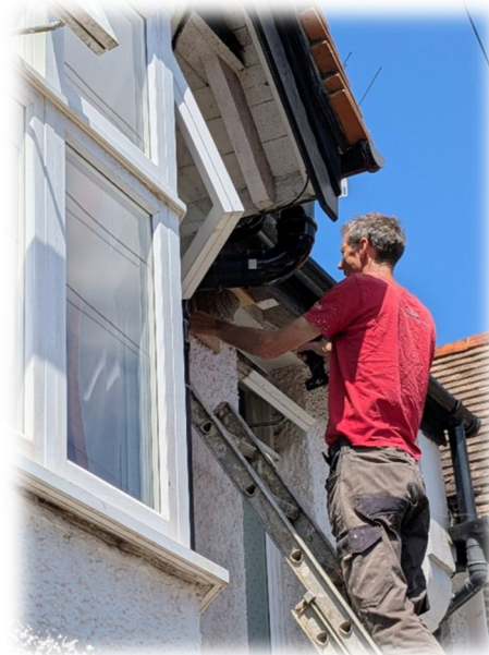
HM cup in Cleve Terrace

You may find out more about our usual arrangements for installing nest boxes in Lewes on our website page: https://e-voice.org.uk/lewesswiftsupporters/helping-swifts/