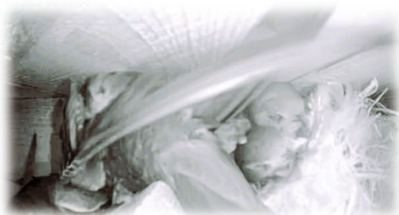
Four Swifts in the nest 25th July

chicks became more restless, moving from the lower to the upper part of the nest space and beginning to flap their wings. We think that the Swift chicks fledged at 7.18 a.m. on 28 th July. Swift experts advise that the fledglings leave the nest and join parties of younger Swifts to immediately begin their return towards Africa, not landing again until they are ready to breed in their fourth summer. The parents may return to the nest for a few days before beginning their migration separately. The male and female will not meet again until they return to the same nest space next year.