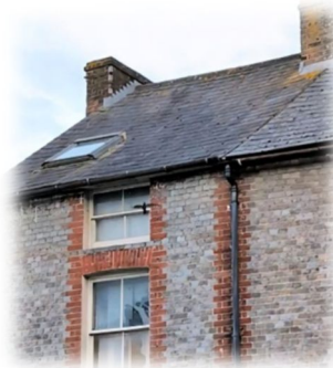
Swift entering nest 1 in Western Road

We have seen other nests visited repeatedly since late April or early May. For example, we have recorded 106 entries to, or exits from, nest 3 at the junction of Western Road and Spital Road since 2 nd May. Although we cannot see inside the nest, we would like to think that this indicates successful breeding has taken place here!