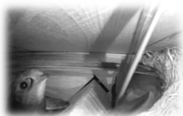
Two Swifts 14 th May

On 20 th June, we were able to distinguish two chicks amongst the tangle of Swifts in the nest. As the chicks grew we were able to see them more clearly when the parents left to hunt for the 20,000 insects needed every day to feed themselves and the chicks.