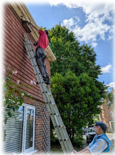
Swift box in Church Lane

Do get in touch with us with an email to lewesswifts@gmail.com if you are interested in installing a Swift box or an artificial House Martin cup at your home.