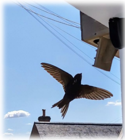
Swift entering Valence Road nest box 8 th July