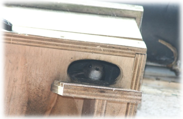
Swift in the Valence Road nest box, 1 st August