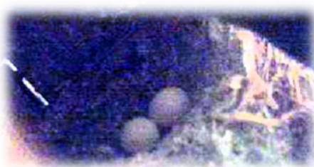
Two Eggs 28 th May