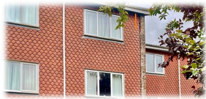
Old Malling Way