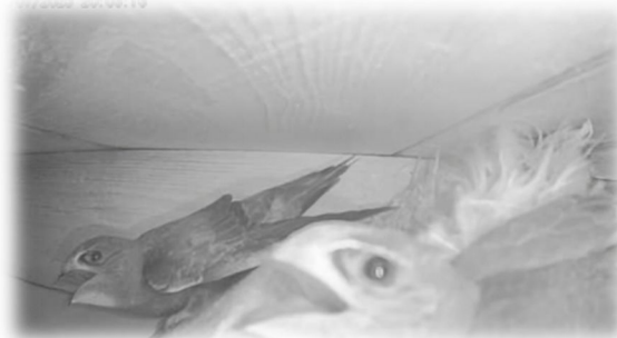
Two chicks, showing their wide gape, 12 th July

It takes thirty days before the fluffy baby coat is replaced by feathers and by July we could plainly see the feathers developing. RSPB suggest that Swift chicks reach their maximum weight after four weeks, then they slim down again as their bodies direct resources to growing their feathers. As they grew larger, the