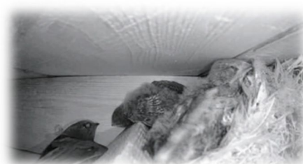
Parent Swift and two chicks 2 nd July