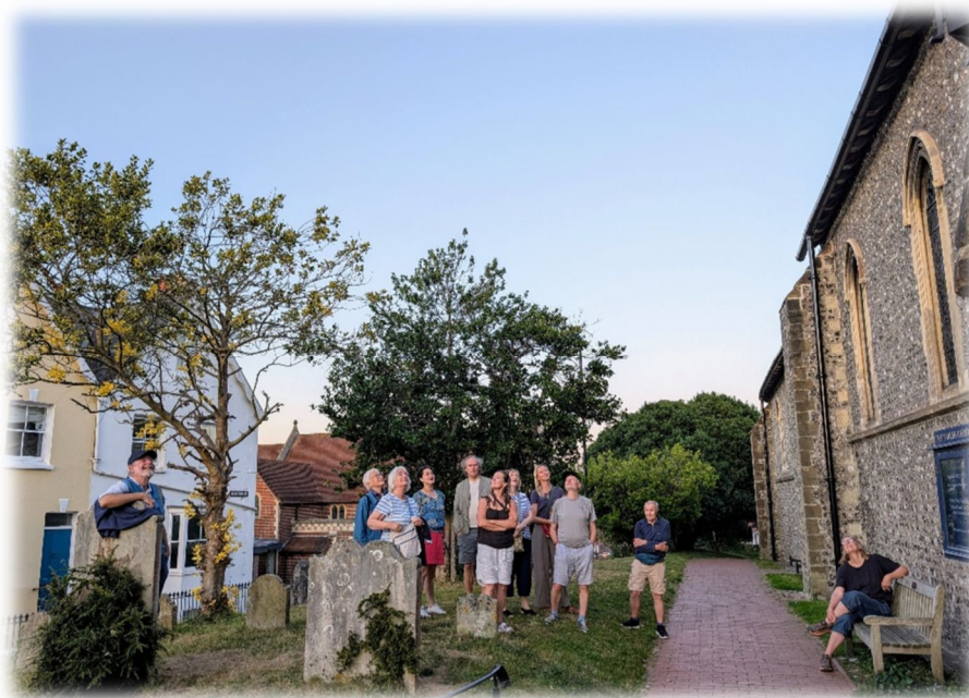
At St. Anne's Church, Western Road

On 11 th July, we met with members of the Wellbeing in Nature group, based at the Railway Land to lead them on a walk around some of our Swift colonies. On the way we saw a Swift enter the broken air brick at Westfield House, one entry at St. Anne's Church and five Swifts entering nests in upper Western Road. These walks are part of our partnership of the Mosaic Project with the Railway Land, Lewes Urban Arboretum, Wildflower Lewes, and Common Cause. You may find out more about the Mosaic Project, and add your garden to the map, here: https://www.railwaylandproject.org/lewes-mosaic-map