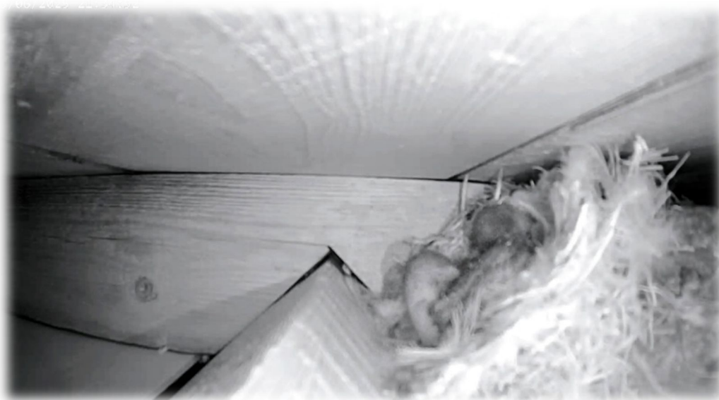
Two chicks in one of the nests at King Henry's Road, 23.6.25