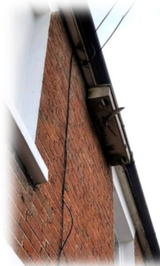
Swifts in June 2025