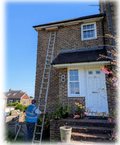
Prince Edward's Road

Since we started up in 2019, we have installed 142 single nest boxes, 53 double nest boxes, and one triple nest box, making a total of 251 potential breeding spaces available for Swifts in the future!