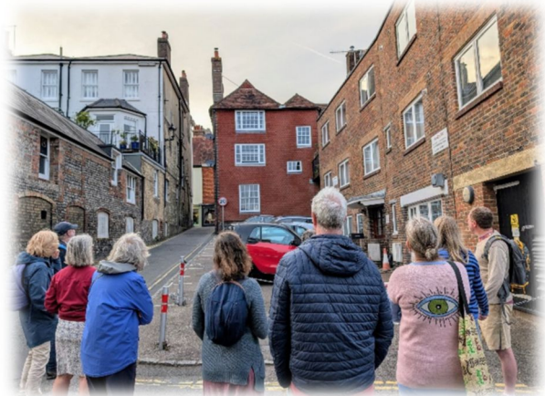
St. Swithun's Lane