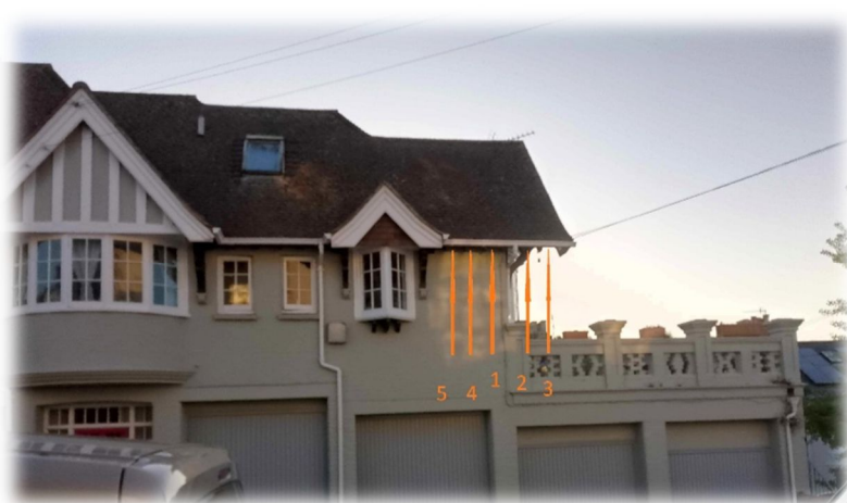
Gallows Bank, Abinger Place