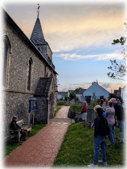
St. Anne's Church