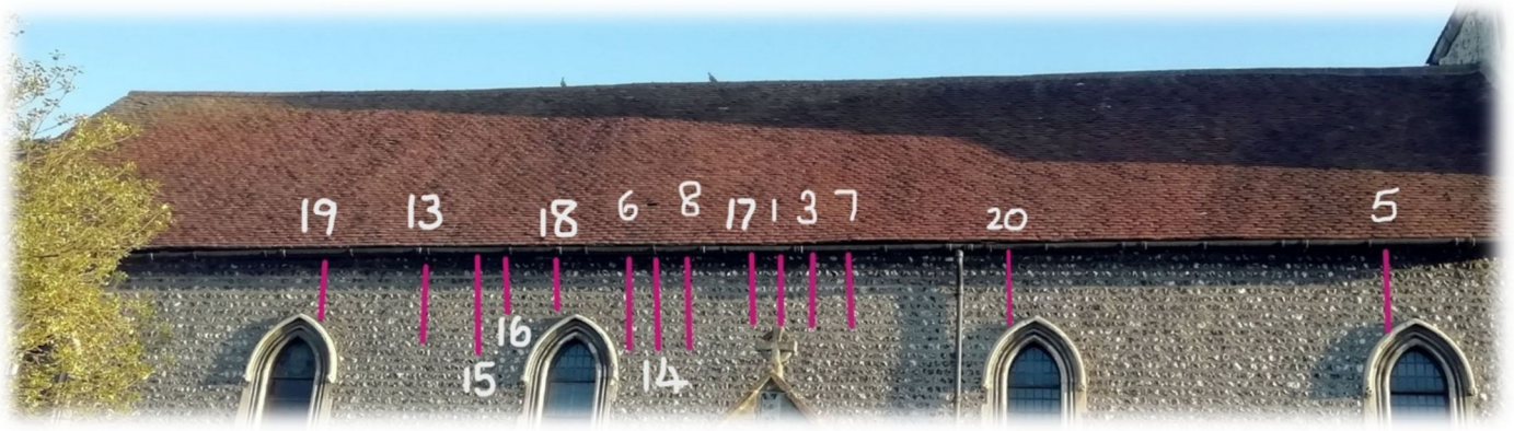
Western end of the front of St. Anne's Church