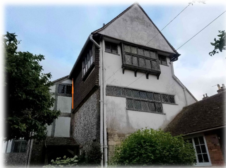
Rear of Anne of Cleves House