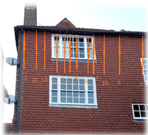
Top of St. Swithun's Lane