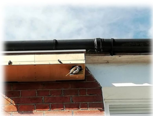
Sparrows in April 2021

When we are installing boxes, we always ask residents not to worry if Sparrows start using their box. Their presence can help the Swifts to notice the boxes – and Sparrows need our help too! The double Peak box installed in Valence Road in 2021 was occupied by Sparrows in every year since then. Prospecting Swifts banged against it last year and several times this year - and Swifts finally entered both sides of the box on 13 th June.