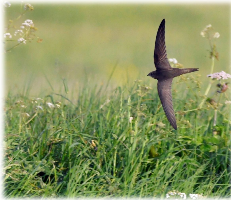
Swift over the meadows by Carl Bovis