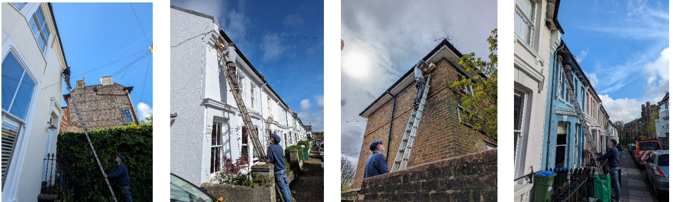
Installing Swift boxes in Abinger Place, Talbot Terrace, and North Way, and an artificial House Martin cup in St. John's Terrace