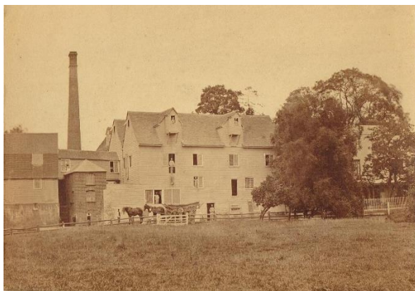
Langford Mill in the late 1700s

Young also introduced new cattle feeds, agricultural implements, new crops and drainage techniques to achieve higher productivity.