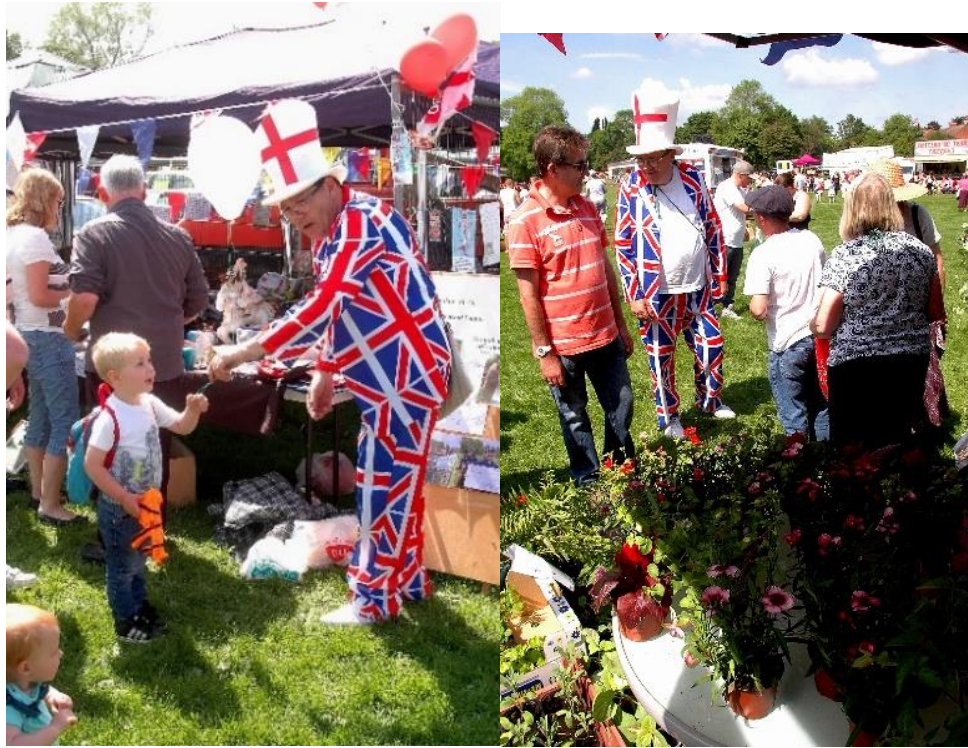
Photos from Chaddesden Carnival