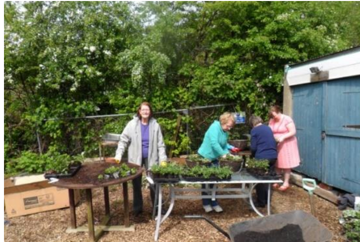
Planting up baskets