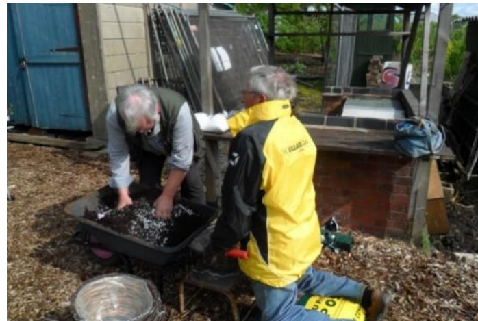
Compost mixing and loading baskets