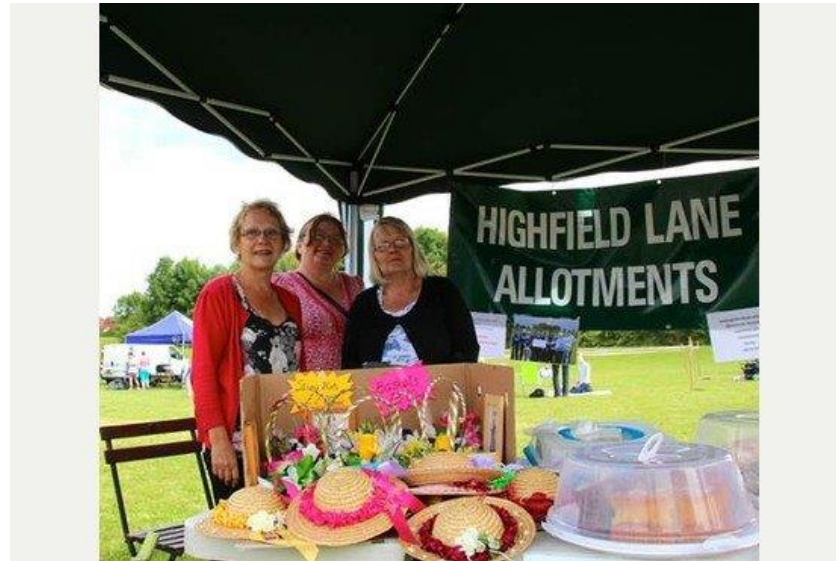
This photo is taken from the Derby Telegraph (14 th July edition).