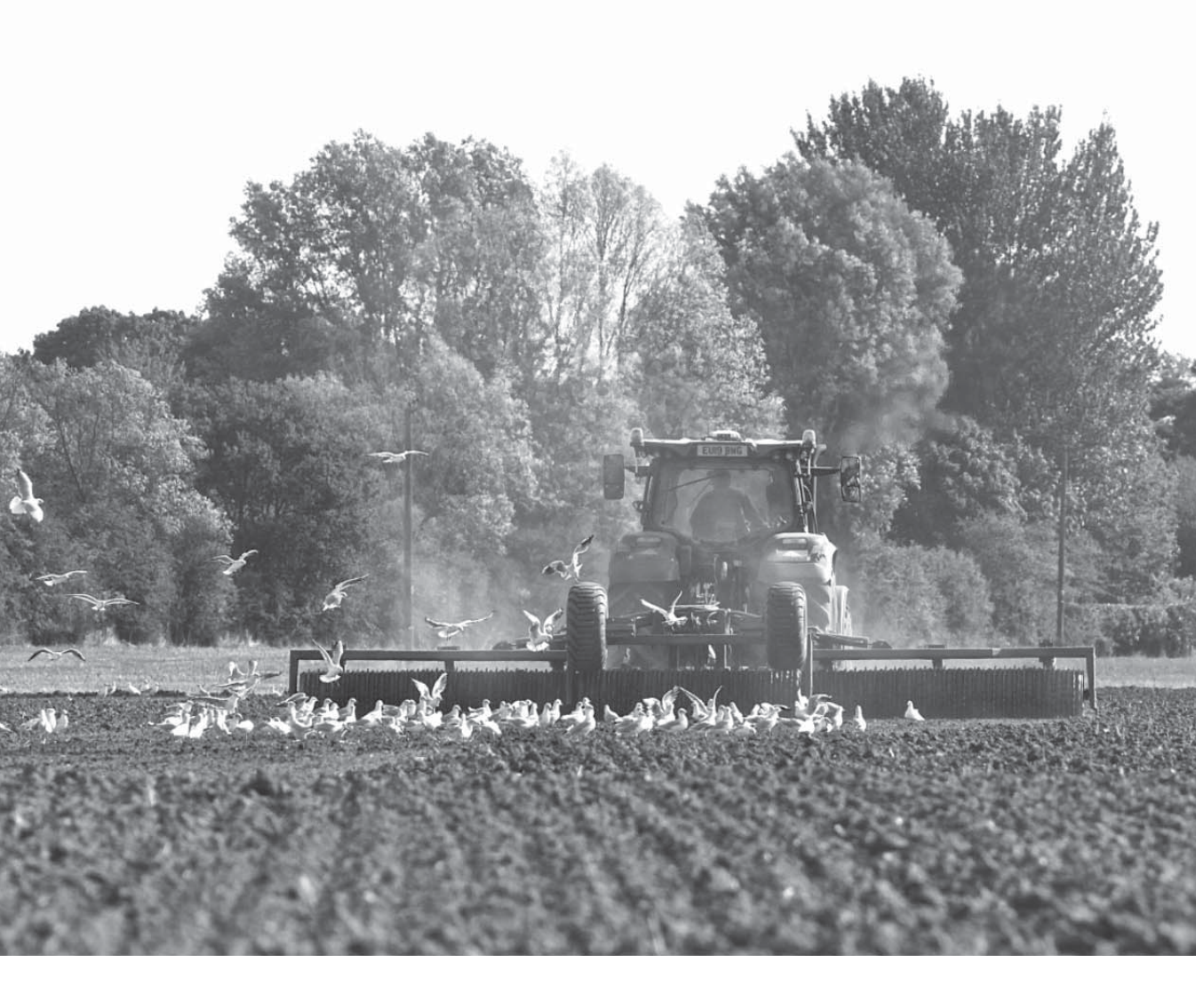
Farming - this photo by Les Brann was awarded first place in the class at the Horticultural Society's autumn show on Saturday 28 September