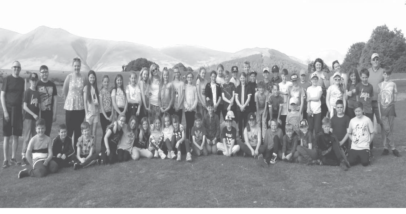
Glorious sunshine all week for year 6 of the Junior School who recently went away for their 5-day residential visit. Amongst other activities, they enjoyed ghyll scrambling, raft building, canoeing and fell climbing amidst the glorious scenery of the Lake District. (And no, that background is not a painted backdrop!)