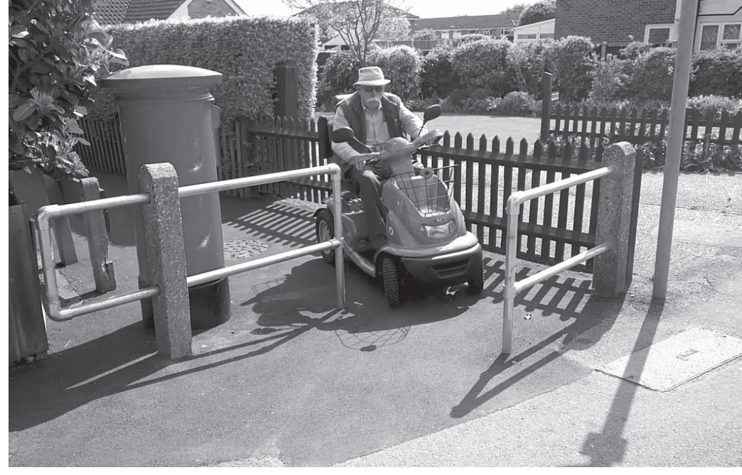
Mobility scooters and baby buggies can now easily negotiate the pedestrian barriers onto The Street from St Andrews Road followng ECC improvements