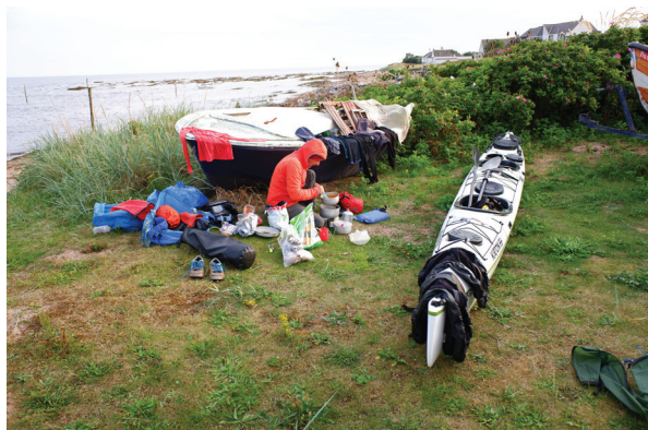
Camping in the boatyard at Carnoustie

then showed us to his bothy, complete with two running taps – one of which ran hot! Like the leaping dolphin, the silver had come again. Later, he returned with a fish for our supper, a Ling. Curious to look at, it tasted like the sea we had traversed only to meet at this lonely headland, the freshness and flavour unlike anything before.