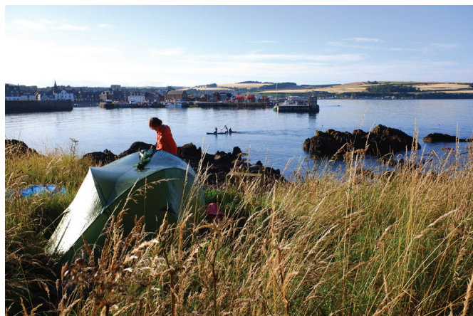
Evening camp, Stonehaven

the magnitude of your dot like existence, as it too is shrunken by the all absorbing, all-encompassing meeting place of sky, sea and land. In a winter storm hell on earth without a doubt, on a calm summer's evening a passage round its tip still leaves you almost breathless and giddy as you pull away to safer waters, silent for fear of waking the slumbering giant that must surely live here. On a rare patch of grass amongst the dunes, we ate in cheerful silence that evening and watched the now distant light turn on for the gathering dusk. Whisky never tasted sweeter.