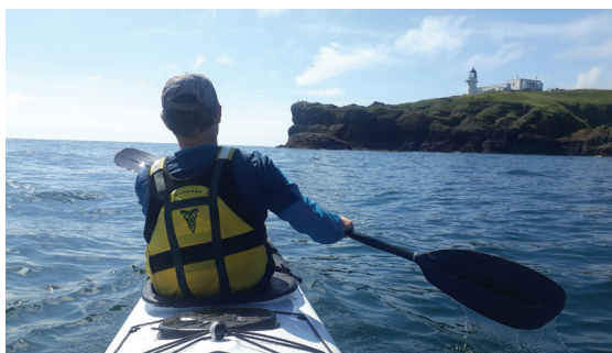
Todhead Point, just south of Stonehaven

Standing lonely at the junction of the Moray Firth and the east coast, our crux of Rattray Head may lack the grandeur of its rockier brethren, but as a seascape to reposition the perspective of your place in the world, it has very few contenders. The horizon is expansive; the enormous lighthouse of Stevenson fame only increases