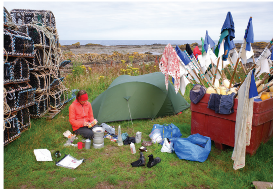
Amongst the lobster pots, Usan fishing Station, Angus

paddleboarders slipping out early from Stonehaven on a dawn tour, the curious silhouette of their bodies stark against the half in, half out of the sea sunrise making me blink away the sleep. The satisfying click-click woof of the lighting gas stove heralded the start of another day on the water, we ate breakfast and then chatted to a visiting friend while the tide finished its ebb to the north and then swung back in our favour. Our last few days had brought glorious conditions for kayaking, sunshine and favourable wind had helped us tantalisingly close to our goal. Our tally of wildlife spotted was impressive – along with our Otter and numerous more Dolphins, an Osprey, Pilot whales and Puffin were showing Scotland off at its best. And of course there were those Gannets too; at Troup Head we had passed the mainland's largest colony, the sky filled with their slender graceful form before, wings folded, they plummeted javelin like into the unsuspecting shoals of fish below. That night we pulled out of the chilly wind to end a long day that took us from the granite of Aberdeenshire to the low bluffs and bays of Angus. Camping looked possible but awkward amongst the lobster pots and creels of a sleepy fishing station. When a fisherman appeared, he offered us a flat pitch for the tent and