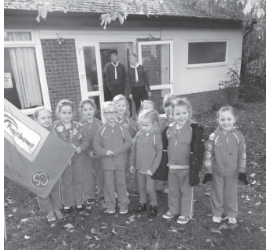
Above: Rainbows line up for the Remembrance day parade. Below dressed up for a 'spooky' evening

We are preparing for the new programme in January as we have had plans in place from September until