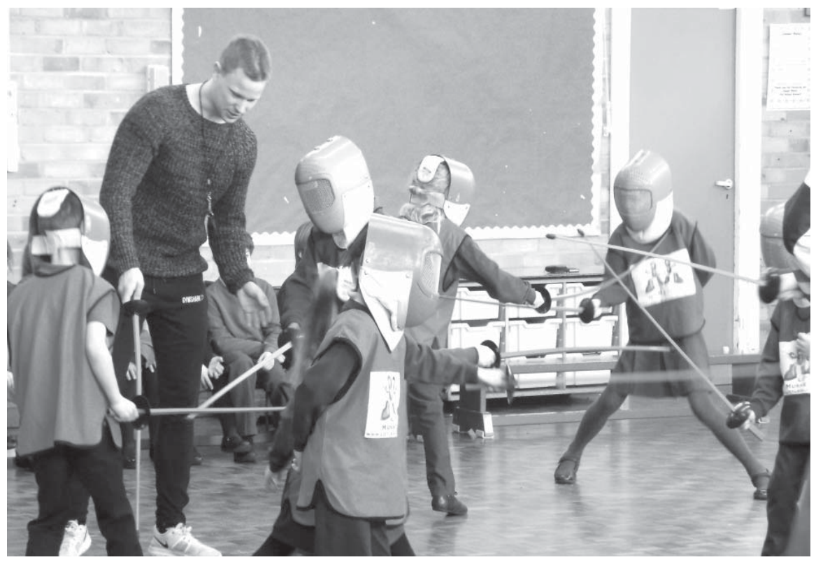
Fencing experience day. A member of the Olympic fencing team visited the Infant School during the winter term and told the children about fencing, showing them how to hold their weapons and demonstrating some of the moves for them to experience the sport for themselves