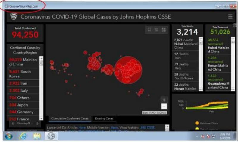
Figure 1. Screenshot of the malicious website "Corona-Virus-Map[dot]com" pretending to be a legitimate COVID-19 tracker.

Fake Online Coronavirus Map Delivers Well-known Malware Date: March 10, 2020