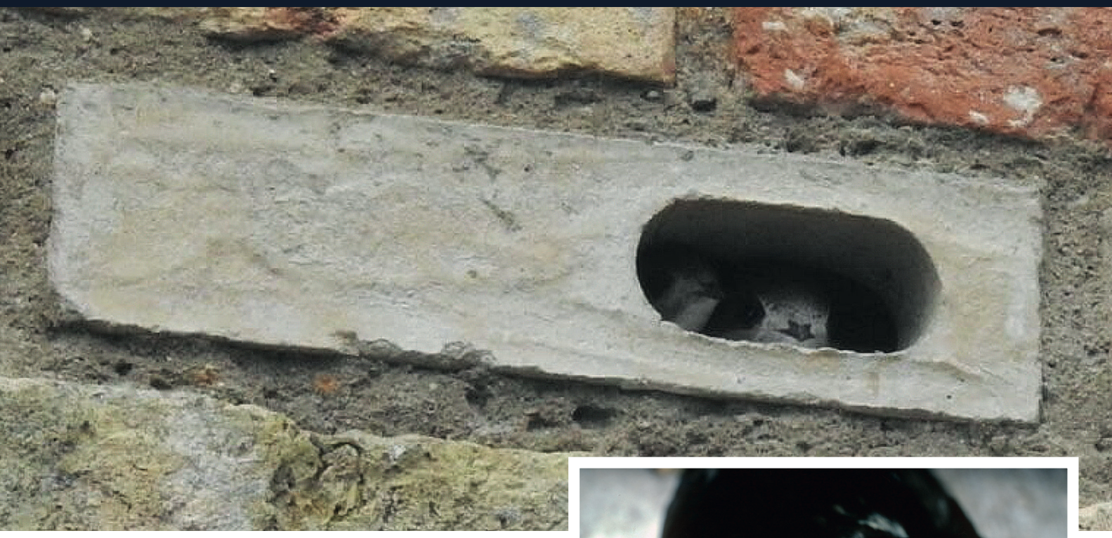
Swifts for great lodgers - no maintenance or special requirements!

May and August and see their chicks fledge and leave, not to touch another solid surface for 2-3 years. One S Brick is simply the size of a normal house brick, usually placed high at the gable end of the house with ample room for a family of Swifts. They are unobtrusive, fireproof in construction and do not compromise the integrity of your new build home.