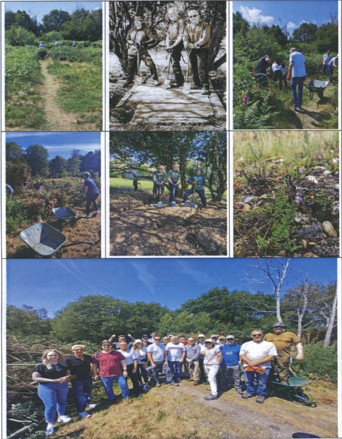
City Parks Volunteers