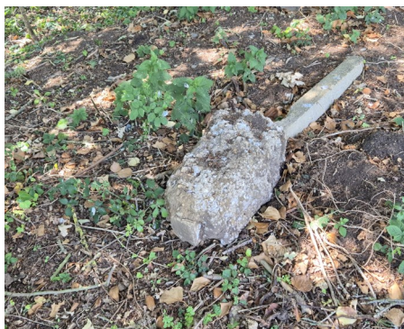
Old concrete post -awaiting removal