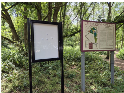
New Noticeboard Church Lane

A Common Lizard captured, on video, by an ecologist whilst working on some surveys on Galleywood Common as part of the new CCC management plan draft.