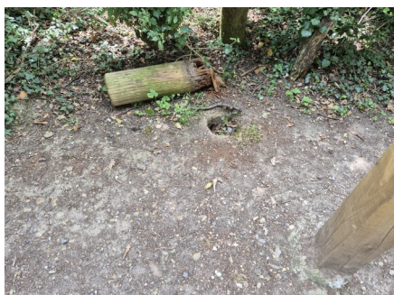
Rotten Post - End of Church Lane