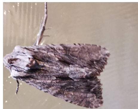
Can you identify this?