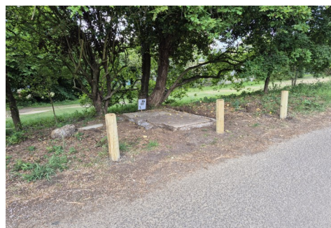
New Safety Posts near Main Carpark