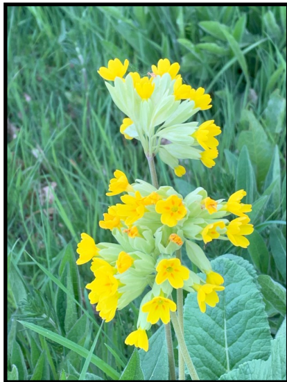
Cowslips - Commonly known in Essex as Peggles

Photos. Courtesy of John Laidler – site area adjacent to A12 North slip road