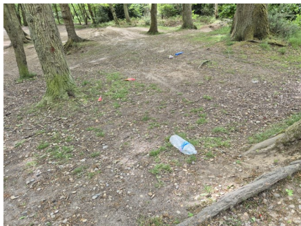
Litter around the cycle bumps area