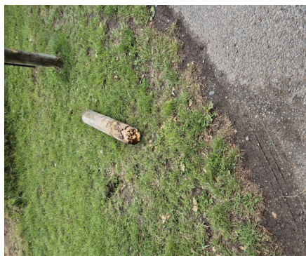
Rotten Post - Carpark entrance