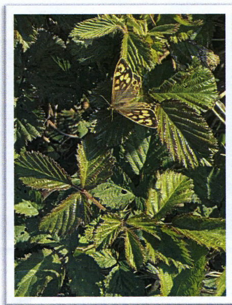
Speckled Wood Butterfly