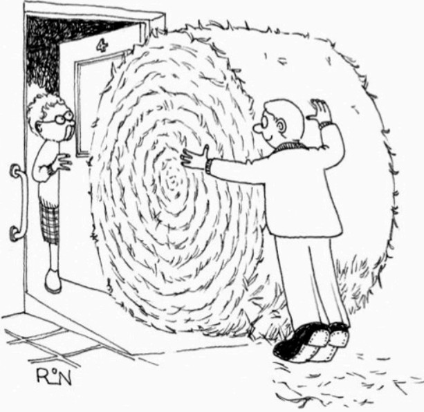
The harvest produce was taken to the old people's bungalows