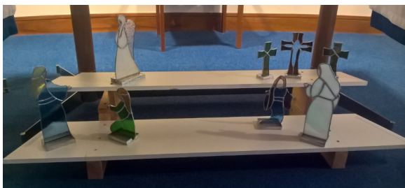
The Easter Garden scene I made for Christ Church in Longridge.

but I have to be content in supporting them and praying for them as they follow Jesus and make him known throughout the Islands. I value keeping in regular touch on line with Melanesian news and meetings.