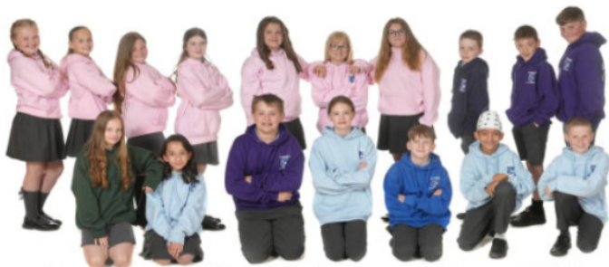
GRIMSARGH ST. MICHAEL'S CE PRIMARY SCHOOL 2026