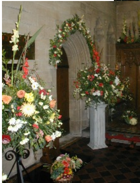
17. Chancel The Harvest Basket