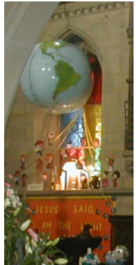
19. Window 1 - The Light of the World