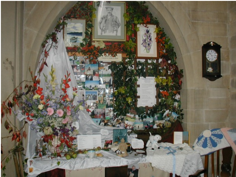
7. Arch Side 2 - What is Man