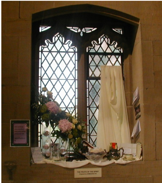
10. Window 1 - The Fruits of the Spirit