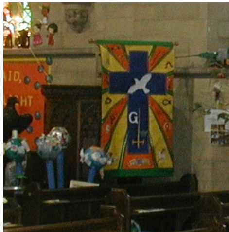
20. Pulpit - Go Into all the World