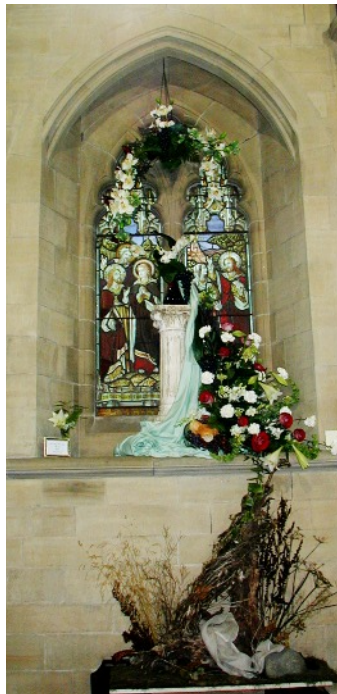
22. Window 3 The Resurrection