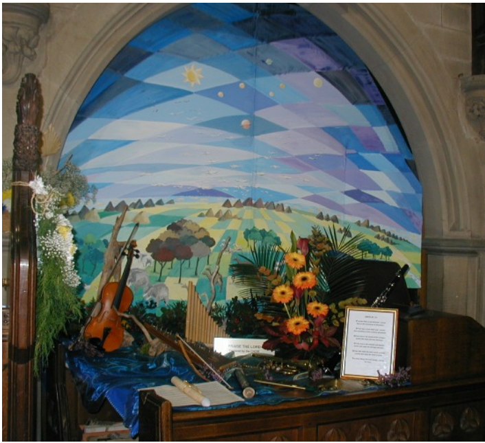
16. Organ - Praise the Lord