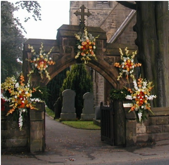
1. The Lych Gate - A Welcome