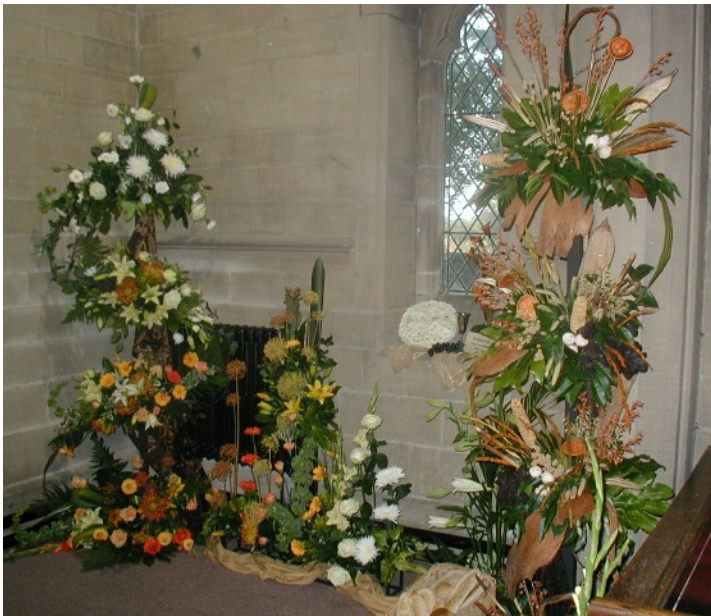
9. Alcove, Pillar & Window- The Bread of Life