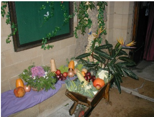
2. Porch The Mustard Seed