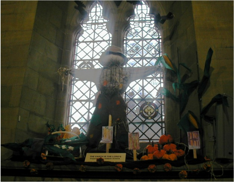
21. Window 2 - The Earth is the Lord's