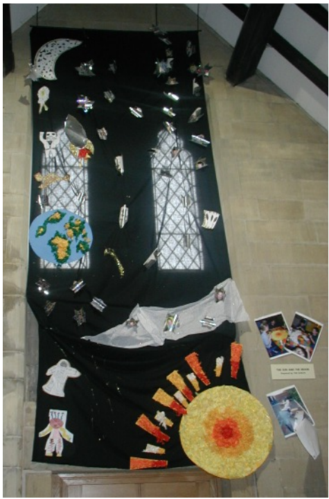
8. Window Over Door The Sun and the Moon