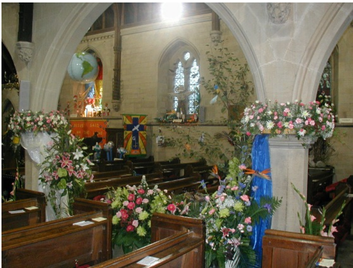
12. Pillars & Arch - The Lilies of the Field & the Birds of the Air