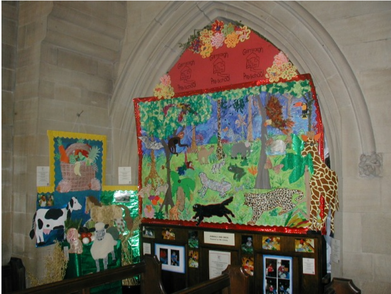
6. Arch Side 1 - Animals and Birds