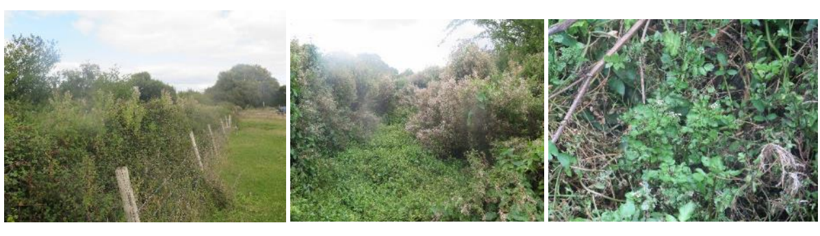
Tall Ruderal habitat Centre of Site 5 Water-cress

Site five comprises of the slow running chalk stream (artificial channel), wet woodland, and some tall ruderal habitat. The Chalk-stream indicator plants found were Water-cress and Floating Sweet-grass.