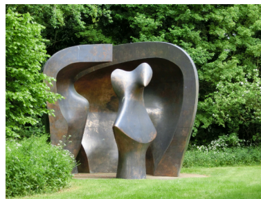
Left –Much Hadham - Henry Moore Foundation in Perry Green