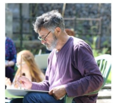
Thank you to the Essex County Council Locality fund for the grant to fund the London trip and purchase the painting equipment.