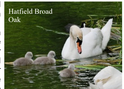
Hatfield Broad Oak

The walk descriptions listed on the Hundred Parishes website provide opportunities to appreciate the tranquillity of this part of the country, to hear bird song, sense the wind in the trees and view some wonderful rural landscapes.