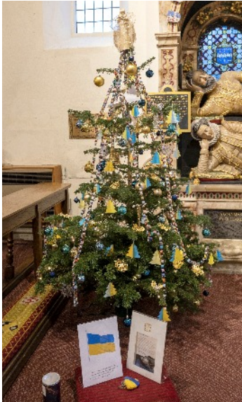
The winning Christmas Tree decorated by the WI

In December 2022, 14 local clubs, businesses, the school, preschool and church decorated trees on the theme of "A Country." During the Christmas Fair, visitors voted for their favourite tree and the runaway winner was the tree decorated by the WI in conjunction with some ladies from Ukraine who are staying in the village. The tree featured beautiful home-made paper decorations, some in blue and yellow. The Community Network was very pleased that they took part and hope they enjoyed this community event.