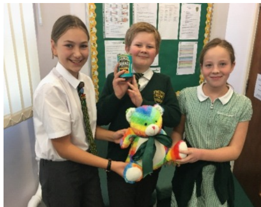
The LIFE ambassadors.

The LIFE Ambassadors work tirelessly to collect food for the Chelmsford Food Bank. They organised a Tin Tower Tournament, where the children brought tins of food into school and competed with each class to build the biggest tower. This term they have organised a, 'Break the Rules Day,' where the children can break rules in school (cautiously!) and bring in a