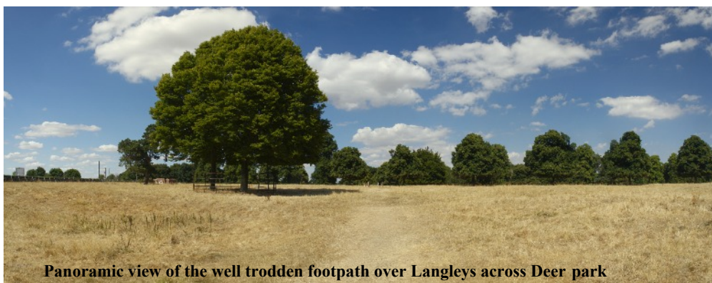
Panoramic view of the well trodden footpath over Langleys across Deer park

The Parish of Great Waltham has been tinder dry for a number of weeks. Hopefully when this issue is delivered we will have had some rain although it will take a lot to replenish the rivers and reservoirs. Pictures have been taken by Barry Teader to record the parched parish of 2022. (More pictures on page 7)