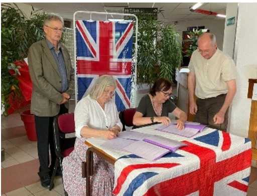
Signing the new Twinning Treaty

In July, Great Waltham Twinning members finally managed to visit their French counterparts in Ceyrat in the Auvergne region, the first get-together since July 2019. The small but intrepid group set off by Eurostar, avoiding Dover, Heathrow and train strikes, and arrived bang on time!