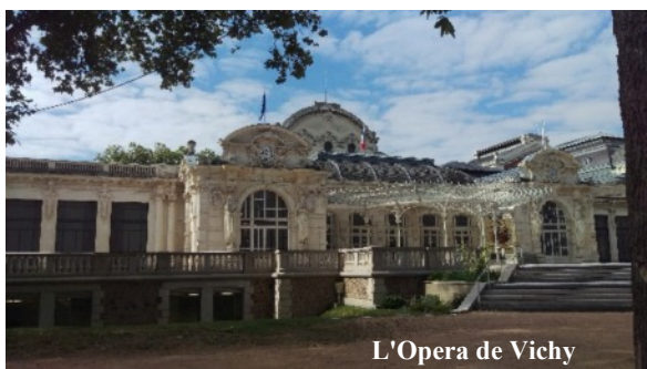
L'Opera de Vichy