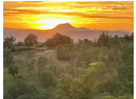
Two of the many beautiful views

We stayed with our hosts in their homes for a week and enjoyed the many organised trips, including a "pate de fruits" factory and l'Opera de Vichy, and basically got stuck into the French way of life with convivial, al fresco dinners and some free time to stroll round idyllic villages and explore this amazing region of extinct volcanoes and beautiful lakes. (More photos on page 7)