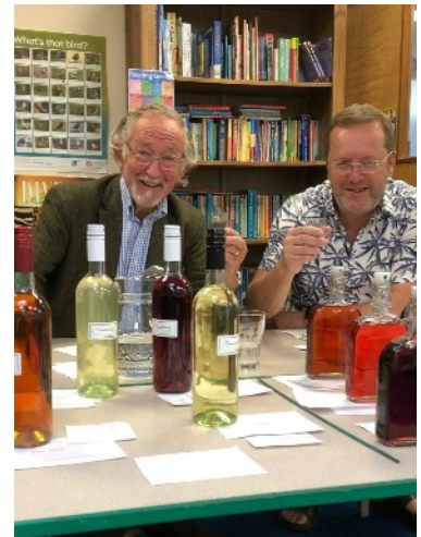
Judging the liqueurs!