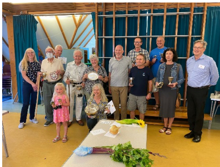
Celebrating success as the show returns More photos page 6