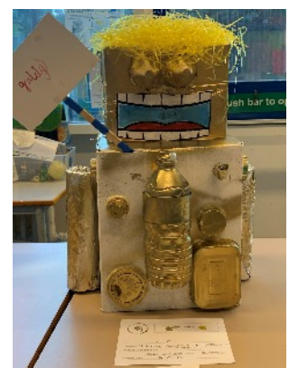
This recycled robot was a winner