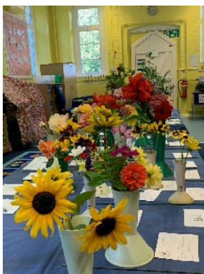
The flower classes attracted plenty of entries