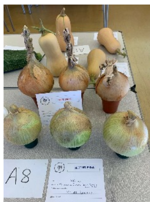
Knowing your onions