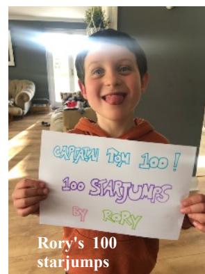
Rory's 100 starjumps