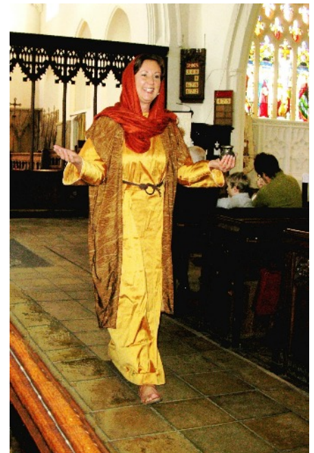
EASTER SUNDAY Mary Magdalene cries, "He is alive! Jesus is alive!"