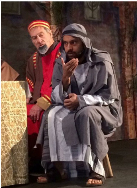
MAUNDY THURSDAY Judas contemplates his betrayal of Jesus