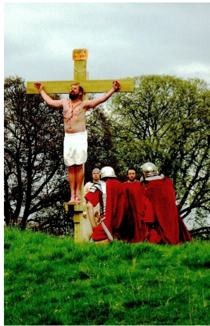
GOOD FRIDAY The Crucifixion