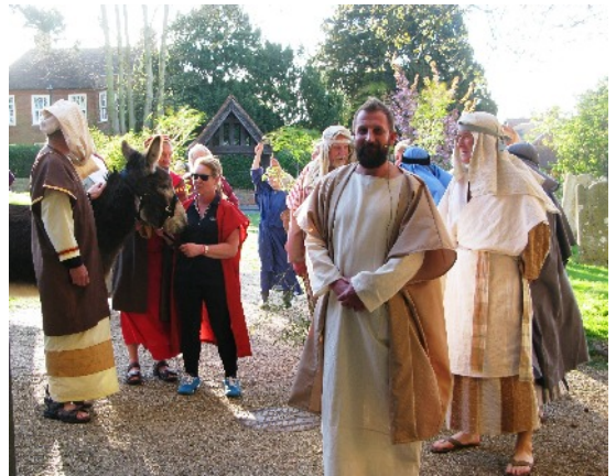
PALM SUNDAY Jesus arrives at the Temple

The whole, unforgettable experience was a fine example of the working together of many people, too numerous to mention, from our churches and also the wider community. Our heartfelt thanks go to them all.