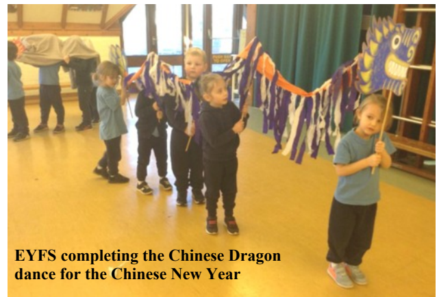
YFS completing the Chinese Dragon dance for the Chinese New Year

Y2 have started learning their songs for the Infant Music Festival that takes place in March. The PTA are looking forward to supporting the children with some curriculum events in the last 1.5 school terms.