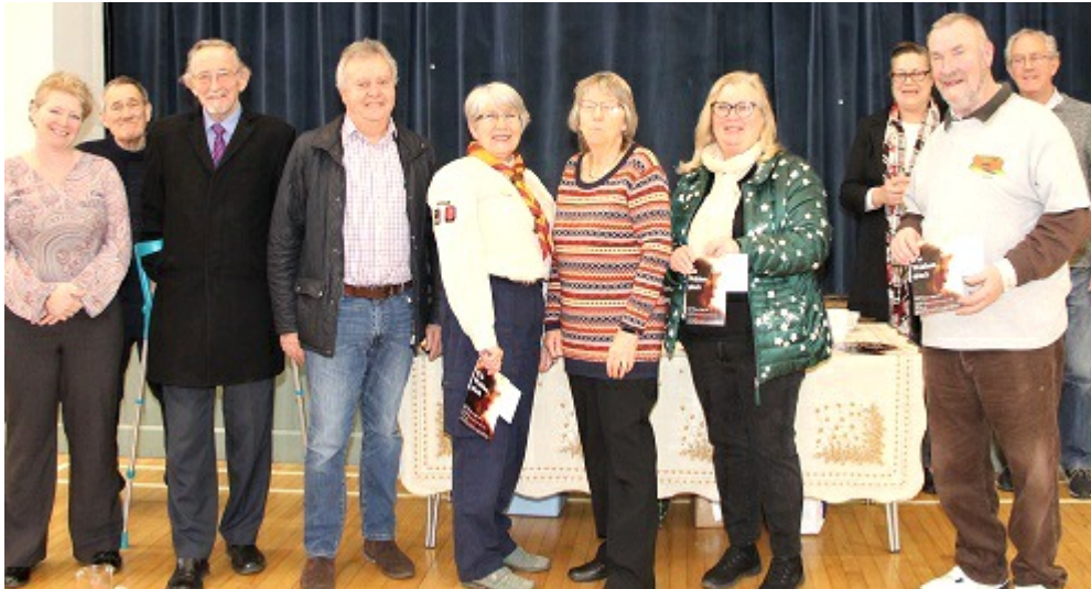
Representatives of the organisations who received donations from the production of 'The Waltham Witch'.