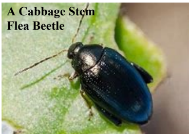
A Cabbage Stem Flea Beetle

flea beetle and how it affects the oilseed rape crop. We had the opportunity to dissect some oilseed rape stems to look for cabbage stem flea larvae and see first-hand the damage they cause to this extremely valuable crop. Questions flowed, and the evening was most enjoyable.