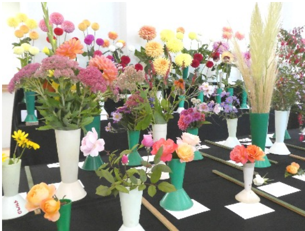
Some of the beautiful flowers displayed