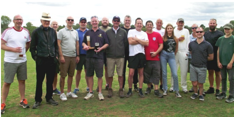
A group photo of all the players