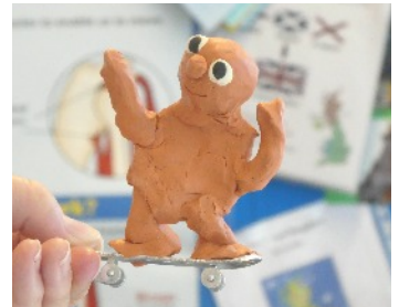
A winning craft entry in the childrens section

Local photographers showed off their skills on themes including Holiday and Harvest, and one of the highlights in the craft section was a beautiful flower-patterned