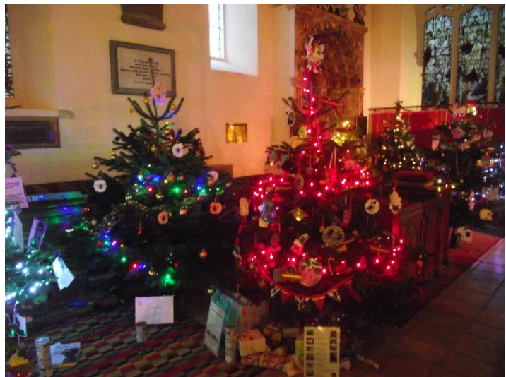
Some of the magnificent Christmas Trees on display