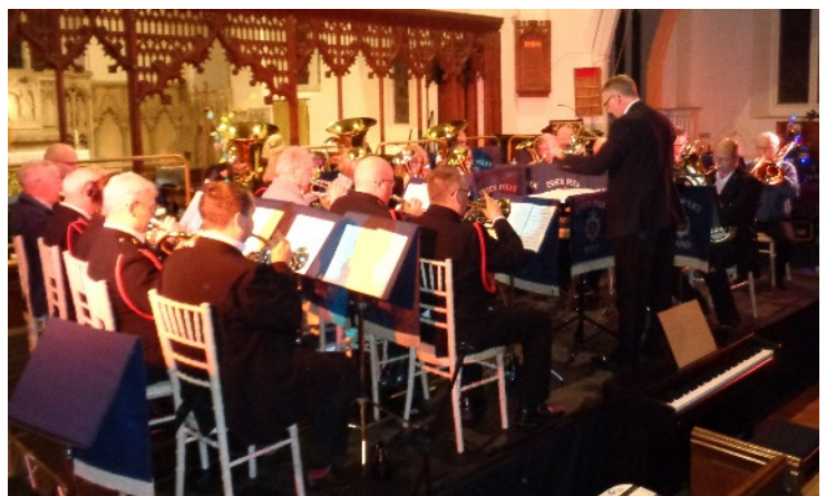
Essex Police Brass Band