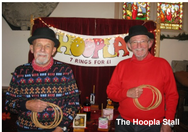
The Hoola Stall

The following weekend, the Waltham Eagles played to a large crowd in the church (picture on page 3) . The funds raised went to the Community Network, the PCC and the British Legion and helped to pay some of the expenses of the Christmas Tree Festival.