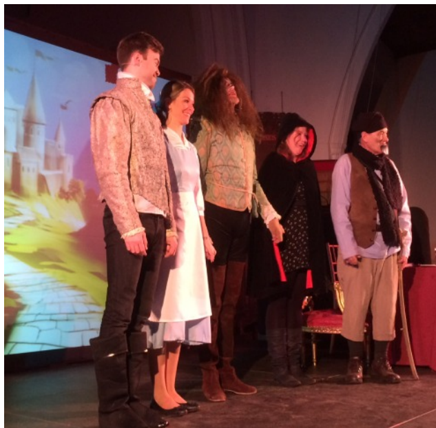
The cast of Beauty & the Beast