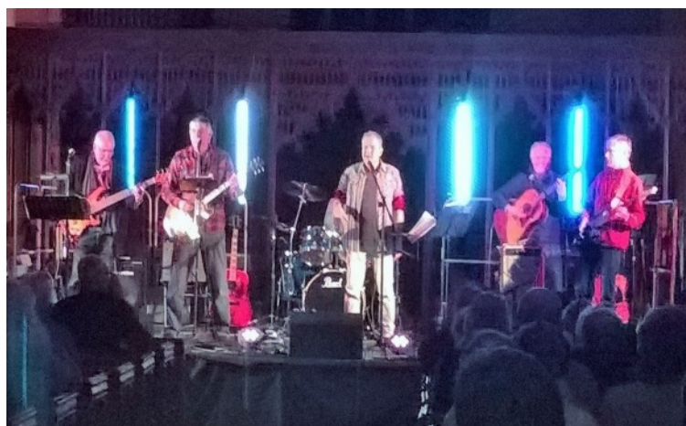
The Waltham Eagles performing at the Christmas Tree Festival.

The Choir were singing at the Christmas Tree Festival in Great Waltham Church to a packed audience. The Village Choir resumes after the new year in the Great Waltham School at 7pm on Thursday January 4th. Come and join us!