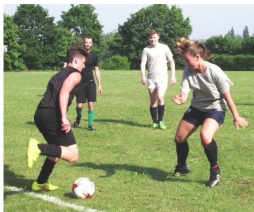
Hard fought action between the Green Man and The Rose and Crown