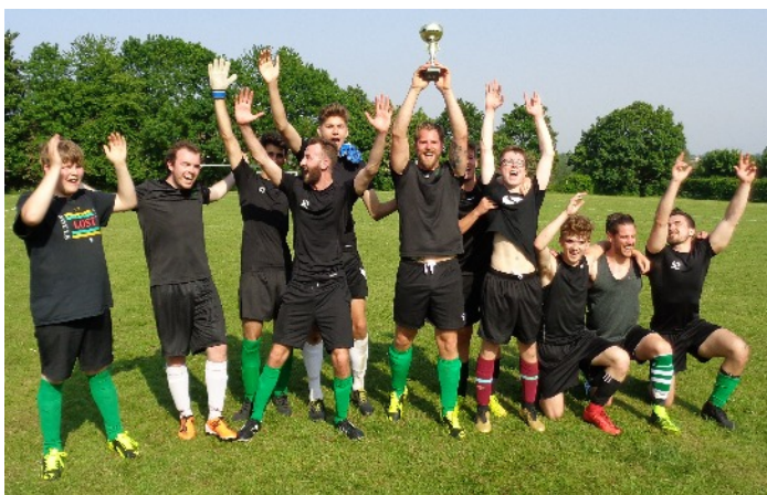
The Winners - The Green Man Team