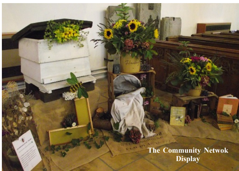
The Community Network Display