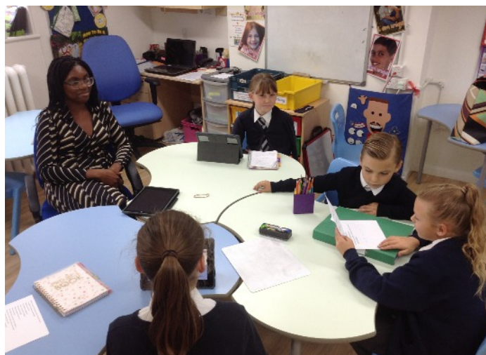
MP Kemi Badenoch being questioned by four children from KS2