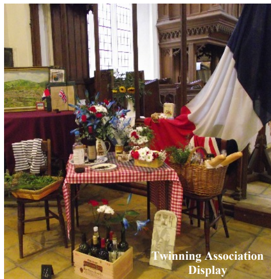
Twinning Association Display