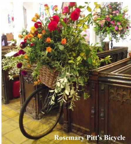
Rosemary Pitt's Bicycle