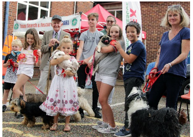
Not-So-Serious Dog Show Winners and

It was great to see some new faces (both human and canine) and among the winners was Buster, who took Best in Show by Public Clapping Vote, while the Noisiest Dog was won by Comet for his solo barking.