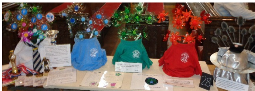
Great Waltham Primary School Display