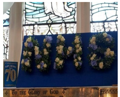
The NHS in flowers

Thanks go to all those who created displays, manned the door and the kitchen, made cakes, cleared up, or who came along to enjoy the beautifully decorated church and made donations. More pictures on page 3