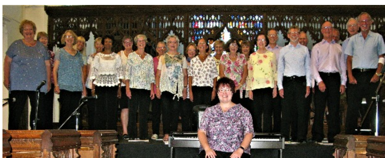
The Choir Performing in the Church as part of the Summer Concert

As you might guess, singing in the Village Choir is a lot of fun. Come on and give it a try. It's open to all; no auditions, no solos! What's more your first night is FREE as is your interval coffee! 7.00pm on Thursdays in the School. Hope to see you there!