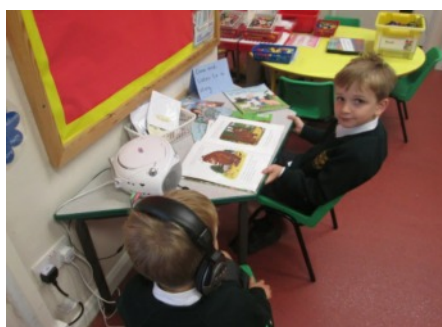
Three children from the reception class who started this term