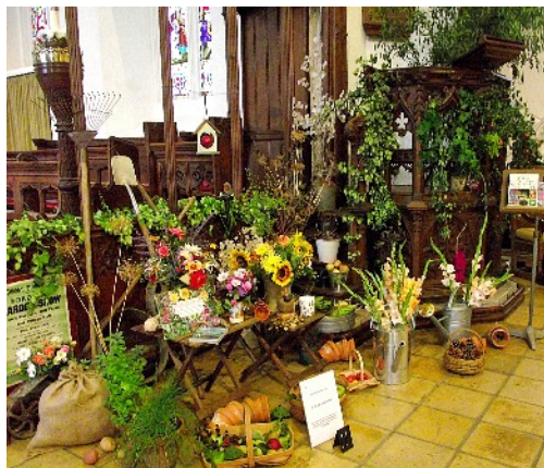
Ford End Gardening Club's Display at the Flower Festival

At our last meeting on 10 September Brian Carline gave us a very entertaining and informative talk on organic vegetable growing. He recommended the organic fertiliser blood, fish and bone as it contains nitrogen for leaf growth, phosphate to encourage root growth and potash for rooting and healthy blooms. Pelleted chicken manure is good for adding nitrogen. Mushroom compost is not in fact organic as the growers spray the mushrooms with a pesticide. The soil does need oxygen so if your leeks are not doing too well he suggested lightly digging around them to incorporate some oxygen into the soil. Nettle leaves and also comfrey can be soaked in water to produce a tonic for plants although this does need to be diluted in the ratio of one part nettle juice to ten parts water and for comfrey the ratio is one part to 20 parts water. The club's next meeting is on Monday 8th October and the speaker will be either Lorna Shaw or Dave Fairlamb from Essex Wildlife Trust giving a talk entitled 'Wildlife Gardening, Your Very Own Nature Reserve'. At the November meeting which is on Monday 12th, Maggie Piper will be coming along to talk about the National Memorial Arboretum. The meetings are held in Ford End village hall and start at 7.30pm.