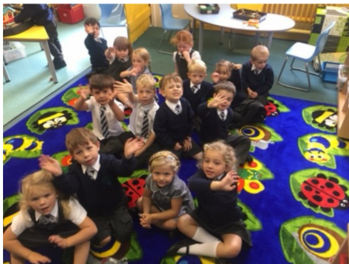
Some of the Early Years Foundation Class 2018

Welcome back to another school year. We hope all the Parish News readers had a good summer. Our new children in EYFS have completed their first few days in school and have settled really well; 100% attendance for the first week, a