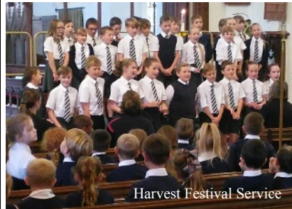
Harvest Festival Service

All the classes enjoyed our Harvest Service at church, making generous donations to the Chelmsford Food Bank. We have