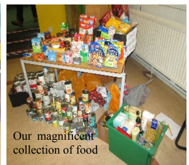
Our magnificent collection of food