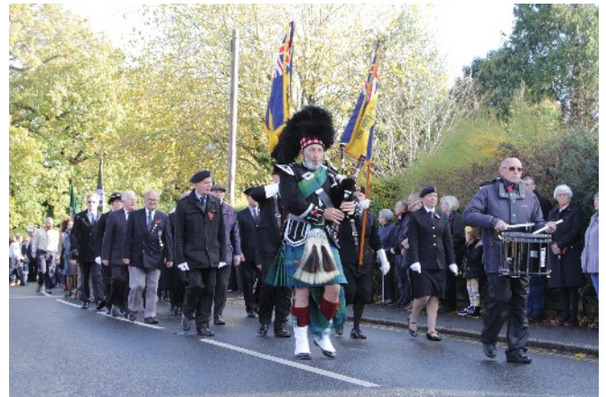
Great Waltham remembers