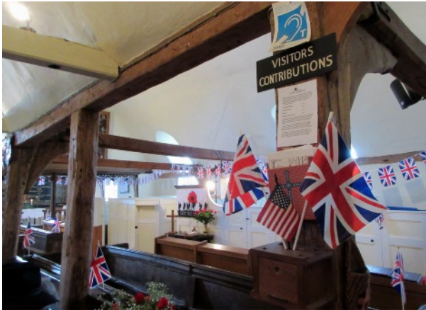
Left - Inside Blackchapel, Right, silhouettes at the Butcher's Arms