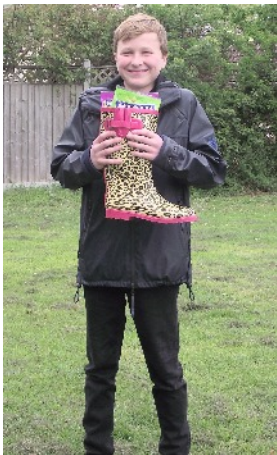
The Winning Welly Wangers