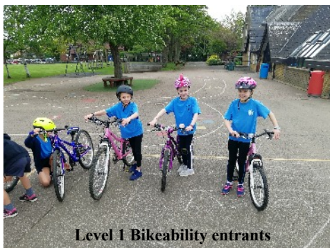
Level 1 Bikeability entrants

at the team county cross-finals at Hadleigh Park. The school football team played their final league game, beating St Pius X 2-0. Not league title this year but they played some super football. KS2 have an Egyptian Curriculum Day coming up after half-term to reinforce their history topic. They look forward to dressing up! EYFS have a day visit to Chelmsford to visit Pizza Express, the library and the park. They are very excited!