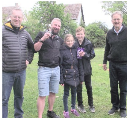
The Winning Boules Teams