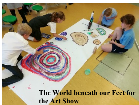
The World beneath our Feet for the Art Show