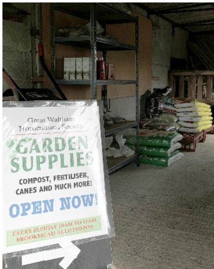
Come and visit the refurbished Supplies Hut open Sundays 10am-11am