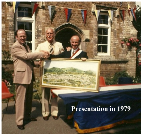
Presentation in 1979

(For further information on Great Waltham Twinning Association, visit www.essexinfo.net/great-waltham-parish/