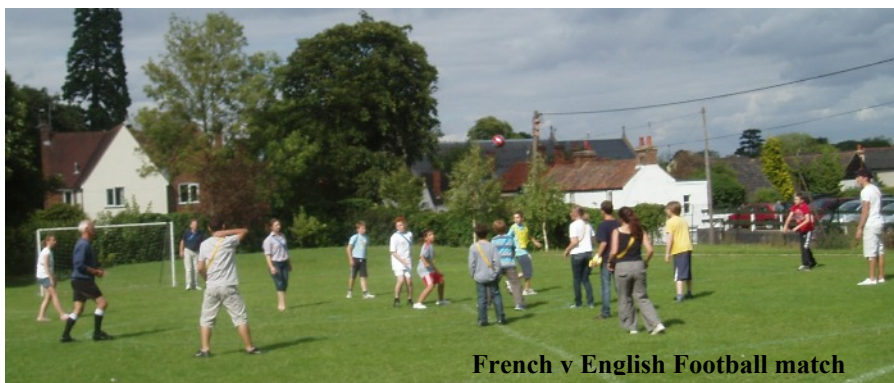
French v English Football match