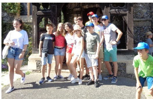
French Youth outside St Peter's church South Weald