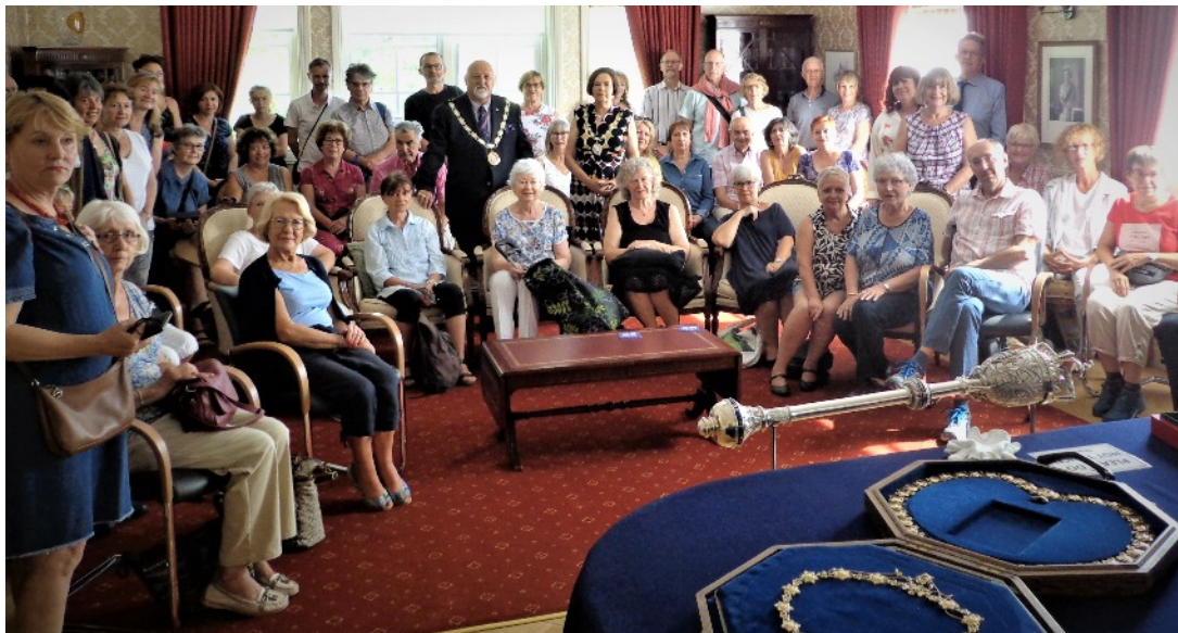
French visit to the Mayors Parlour