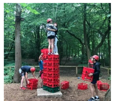
Thriftwood Activity Centre