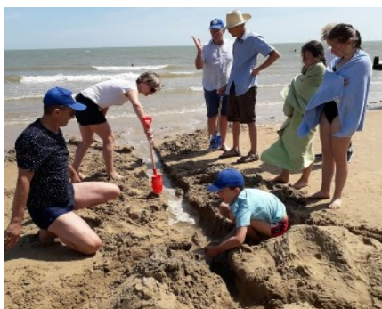
Fun on the beach at Frinton