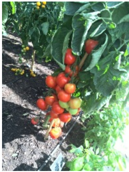
Hyde Hall Tomatoes

We recently visited Barnards Farm Gardens in West Horndon for the July outing. We enjoyed wandering around the grounds where round every corner or clearing we came upon statues of all shapes and sizes. Some amazing works of design and others you can only describe as quirky. There is so much to see, from the formal Japanese garden to the water features in the many ponds. Unfortunately, the miniature railway was not working on the day we were there but I'm sure a ride on that would be great fun. We finished off the visit in the barn where we enjoyed tea and cake and were welcomed by the owner, Bernard Holmes. This is most definitely somewhere I will revisit – a garden of statues !