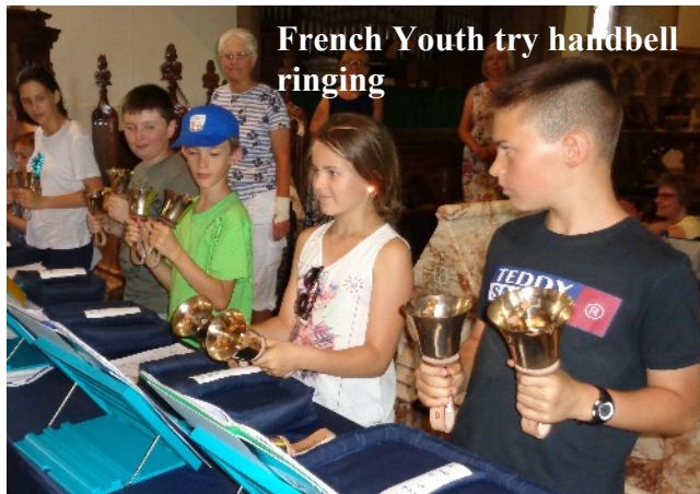
French Youth try handbell ringing