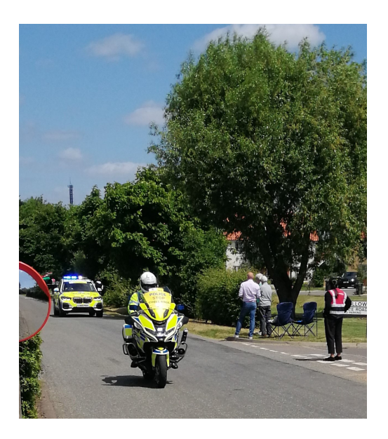
First came the many police motorcycles, and the helicopter overhead