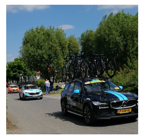
Finally, came the many support cars, with all the required spares