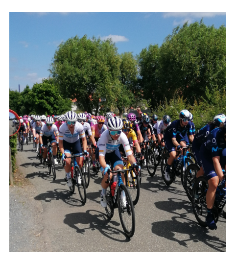
Then gone again, and it seemed a tight fit for all those closely bunched competitors