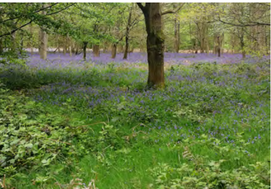
Above left is Shut Heath Wood in early May, and above right is Pods Wood Tiptree