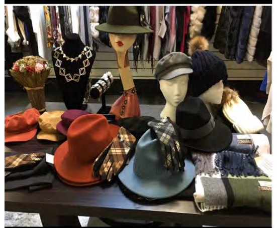
Upstairs at The Emporium, High Street, Maldon New styles for real women – Sizes 10-22 www.onpoiint.com