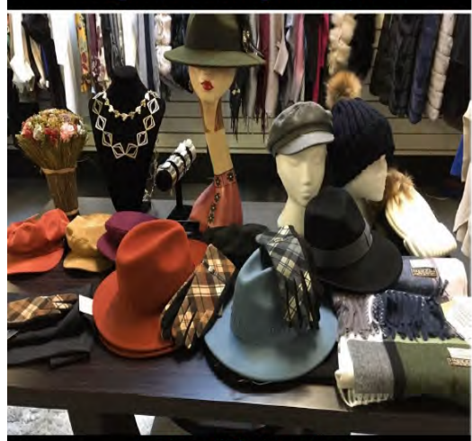
Upstairs at The Emporium, High Street, Maldon New styles for real women – Sizes 10-22 www.onpoiint.com