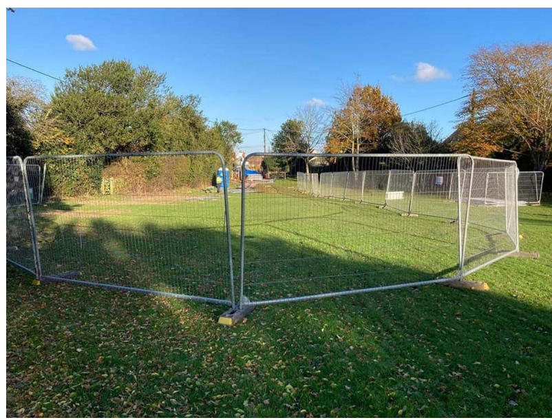
and as seen above the work has now begun, for the new playground...