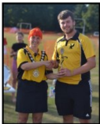
Wooden Spoon Winners Witham

As with the night before, the evening events took full swing with all in attendance partying the night away in the marquee and making full use of the bar.