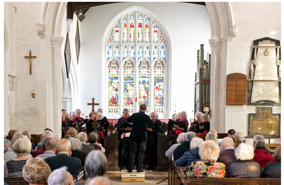
'Afternoon Delight' at St. Catherine's Church