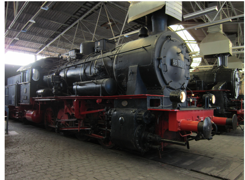
Steam train of yesteryear – Bochum Railway Museum (Ruhr Valley)